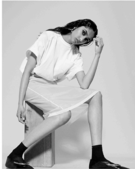
SKIRT BY MAISON MARGHELA, SHOES BY JIL SANDER, AND EARRINGS BY PRIVATE LABEL T-SHIRT BY JIL SANDER, LEATHER DENIM BY AGOLDE, EARRINGS BY LOST GIRL.