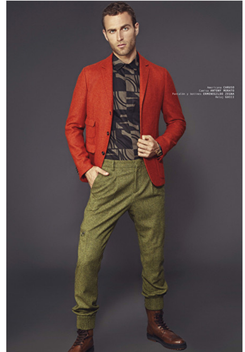
América CARSTO Camisa ANTONY MORATO Pantalón y botines ERMENEGILDO ZEGNA Reloj GUECCI