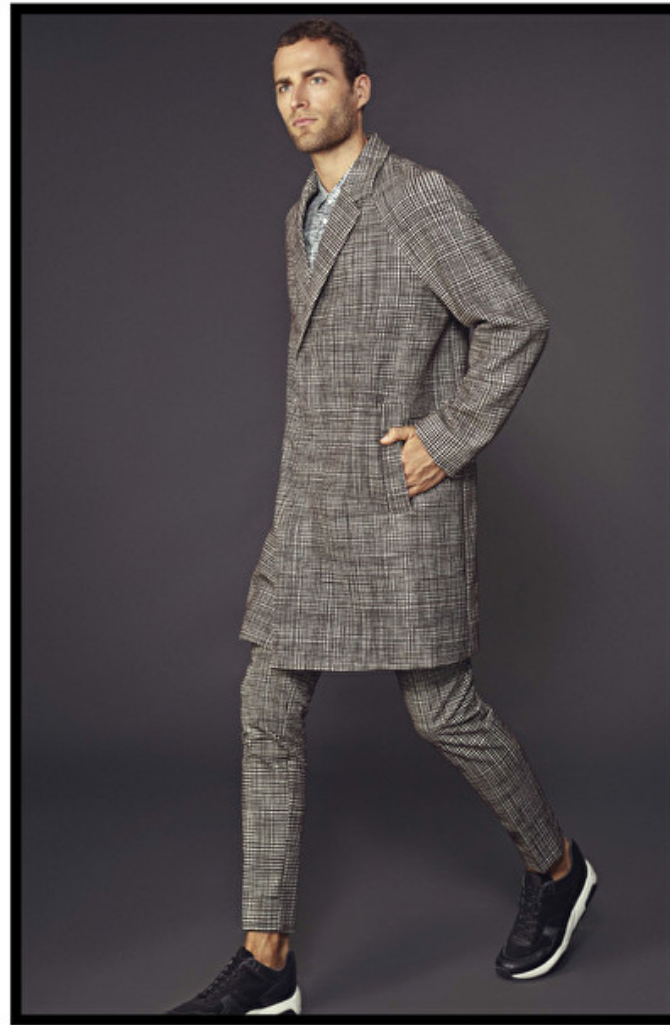
Abrigo, pantalón y camisa COS Deportivas HOGAN