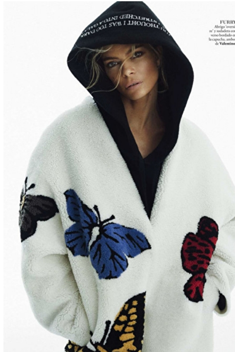
FURRY Abigo 'oversize' y sudadera con verso bordado en la capucha, ambos de Valentino.