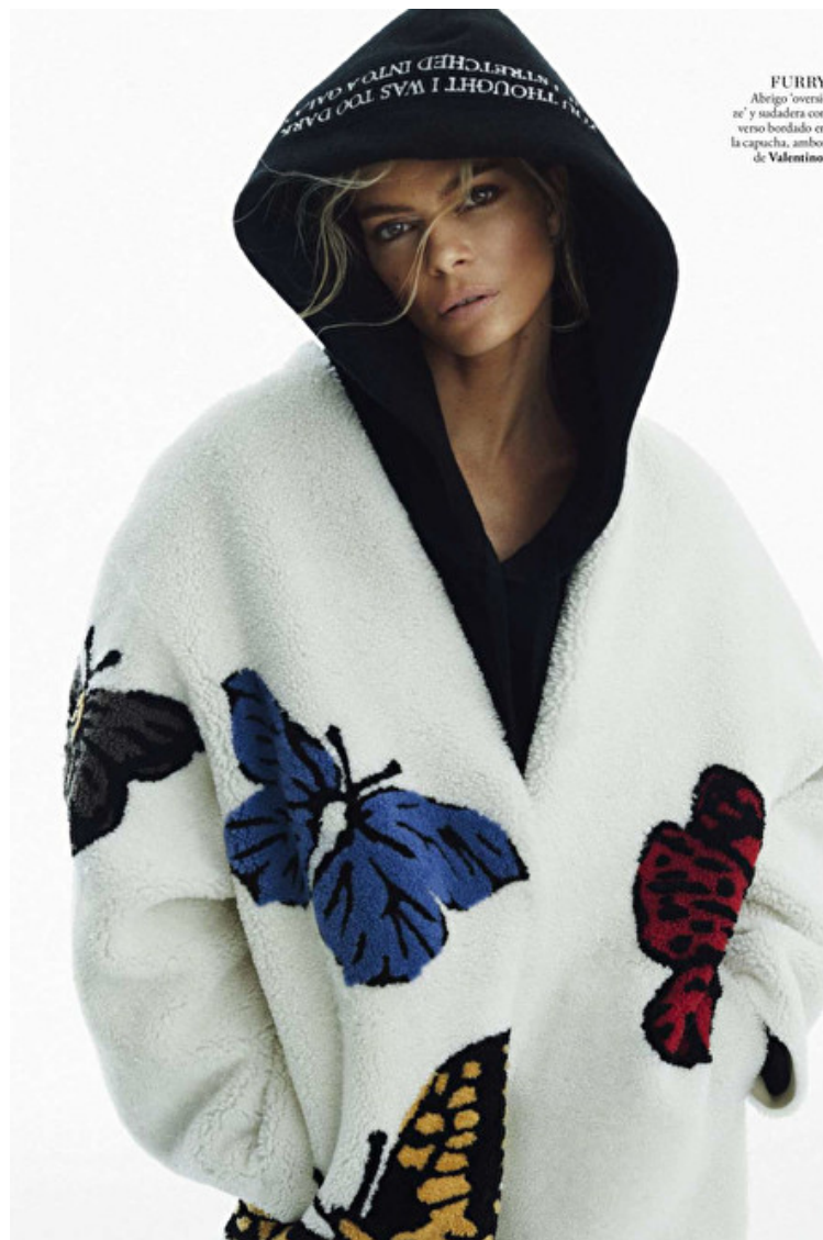
FURRY Abigo 'oversize' y sudadera con verso bordado en la capucha, ambos de Valentino.