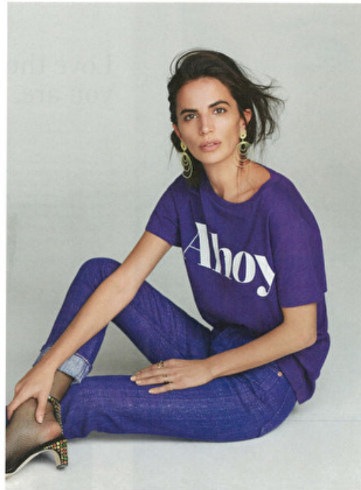
Ahoy there! Set sail into a whole new world of understated cool, in biro-blue denim and oversized tees. Note: this season is awash with '80s accessorising

Cotton T-shirt , £32.50, J.Crew. Denim jeans , £450, King & Tuckfield. Gold earrings , £3,500, Buccellati. Rings , from top: Gold-plated , £200, Nina Kastens. Gold , £250, Loren Stewart at Ottumberg. Gold , £244, Christina Soubli at Jewel Street. Fishnet tights , £11, Calzedonia. Suede embellished shoes , £625, Sergio Rossi