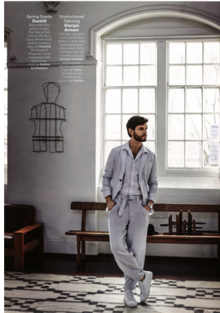
The Jacket Spring 2018