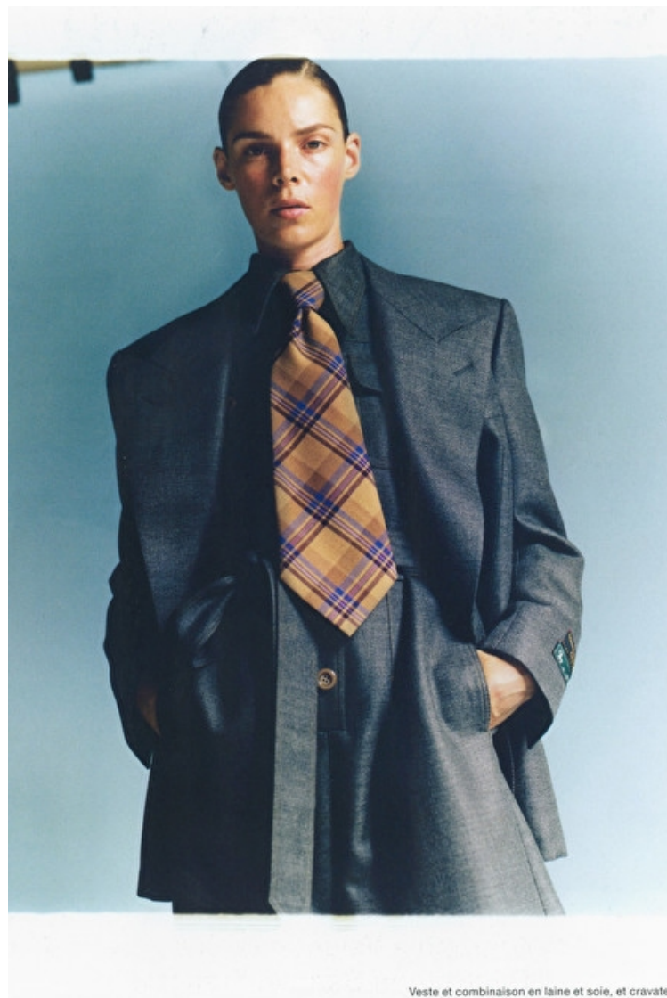
Veste et combinaison en laine et soie, et cravate, 1