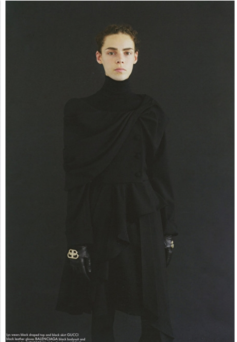
Lys wears black draped top and black skirt GUCCI Black leather gloves BALENCIAGA black bodysuit and boots EMU WOLFBORN black leather boots L'ORÉAL