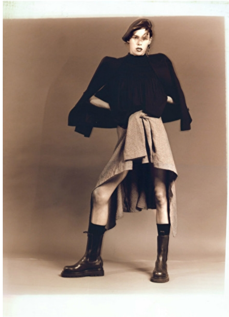
ste en laine et satin, haut en georgette de soie et jupe en laine, CHLOÉ. Béret, ZIMMERMANN. Chaussettes, FALKE. Bottes, BOTTEGA VE