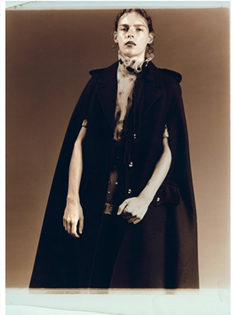
en laine, haut à pois à col volanté en nylonette et short en laine, MIU MIU.