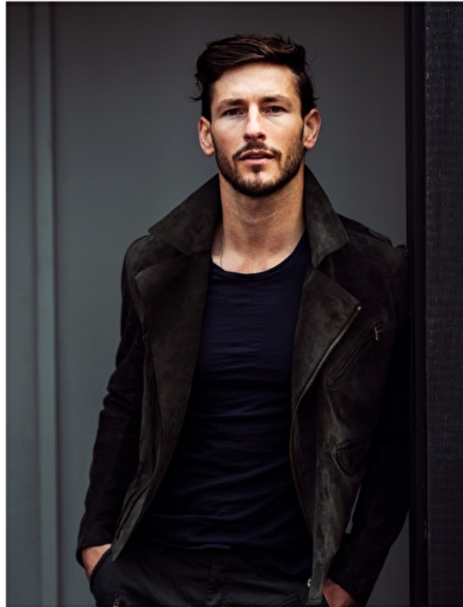
T-shirt, Jacket & Trousers TOMAS MAHER