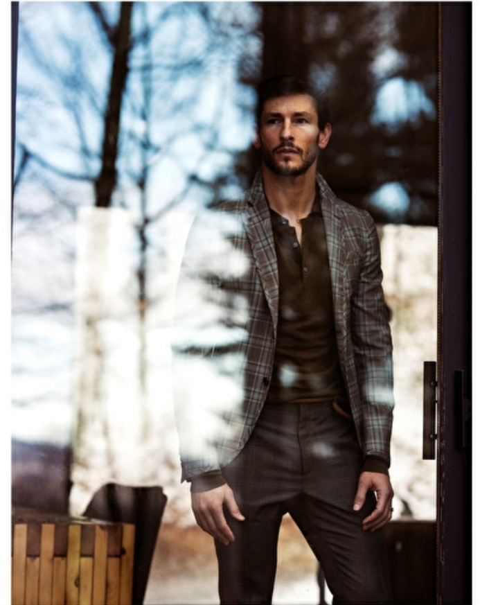
Sweater, Blazer & Trousers SALVATORE FERRAGAMO Bell FENDI (and brand) ELI HALLI