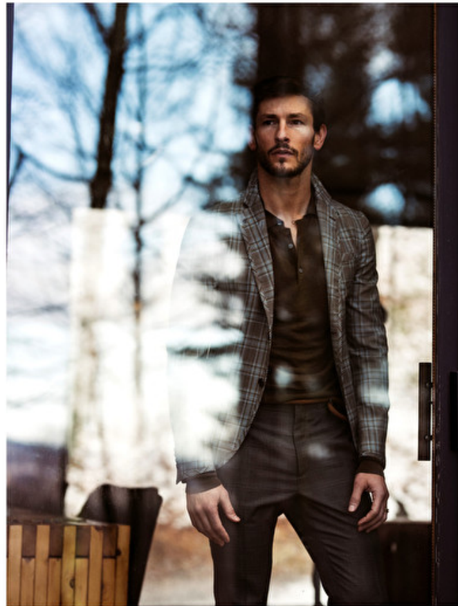
Swoboda, Blazer & Trousers: SALVATORE FERRAGAMO Bluz: FENDI, Sneakers: ELI HALLU