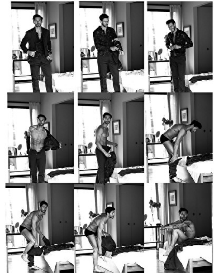
Blazer, Shirt & Trousers: MICHAEL KORS Shoes: YVES SAINT LAURENT

"Choose your life and conquer with a smile. It's OK to be sad. It's OK to be mad. But throughout the day it's your choice if it will be good or bad. Start your day with a smile and end it the same."