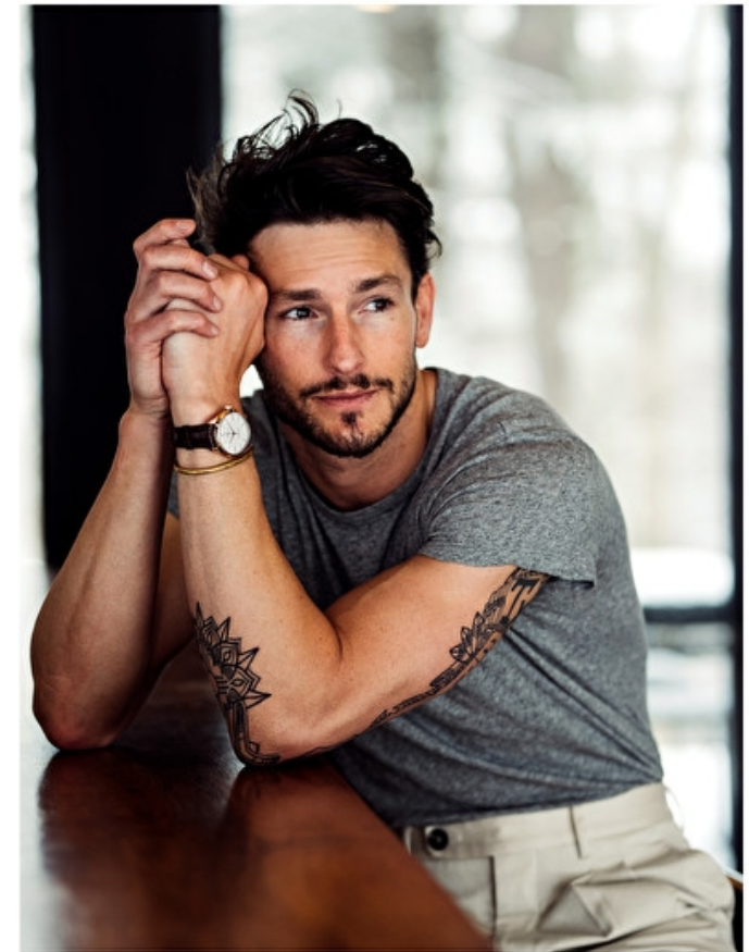
T-Shirt: HIRO CLARK | Shoes: BRUNELLO CUCINELLI | Watch: OMEGA | Bracelet: ELI HALILI