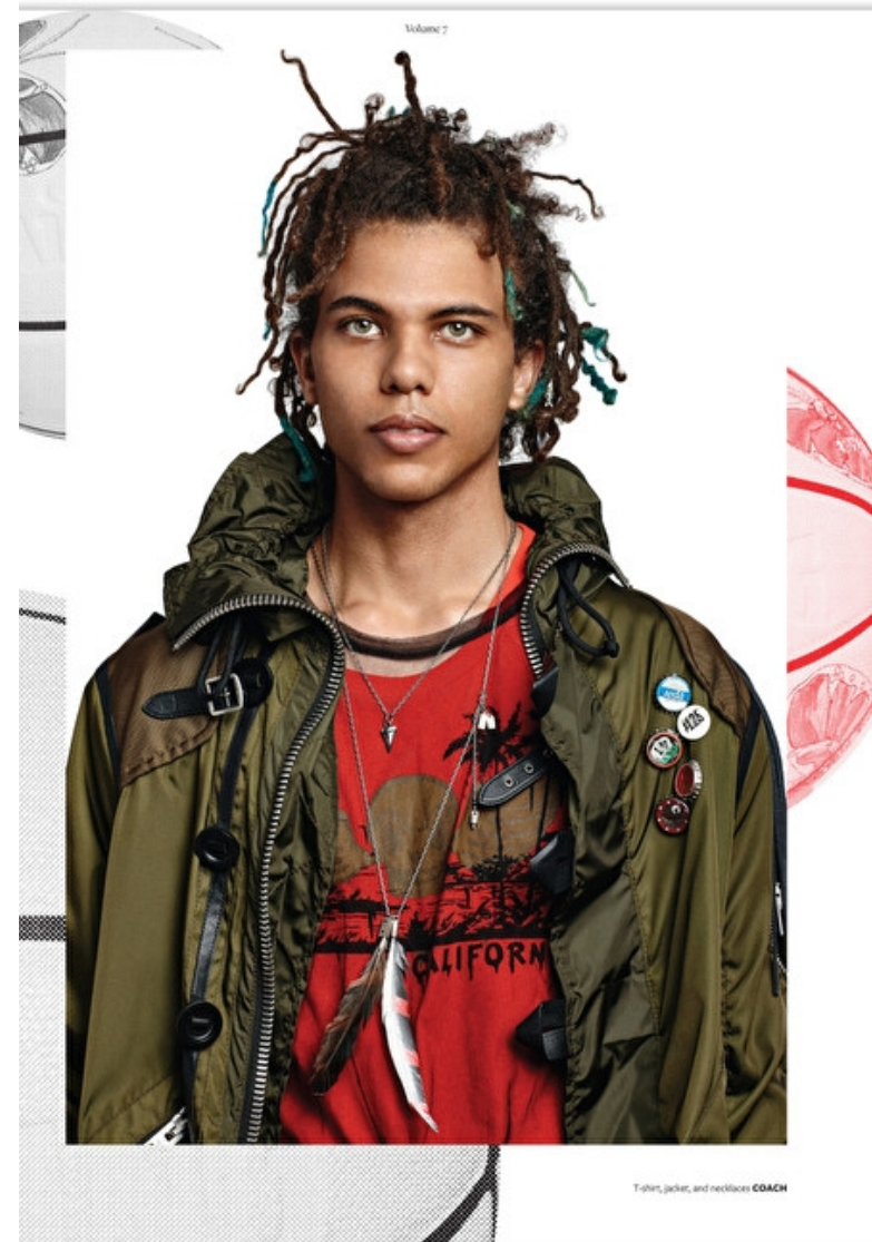
T-shirt, jacket, and necklaces COACH