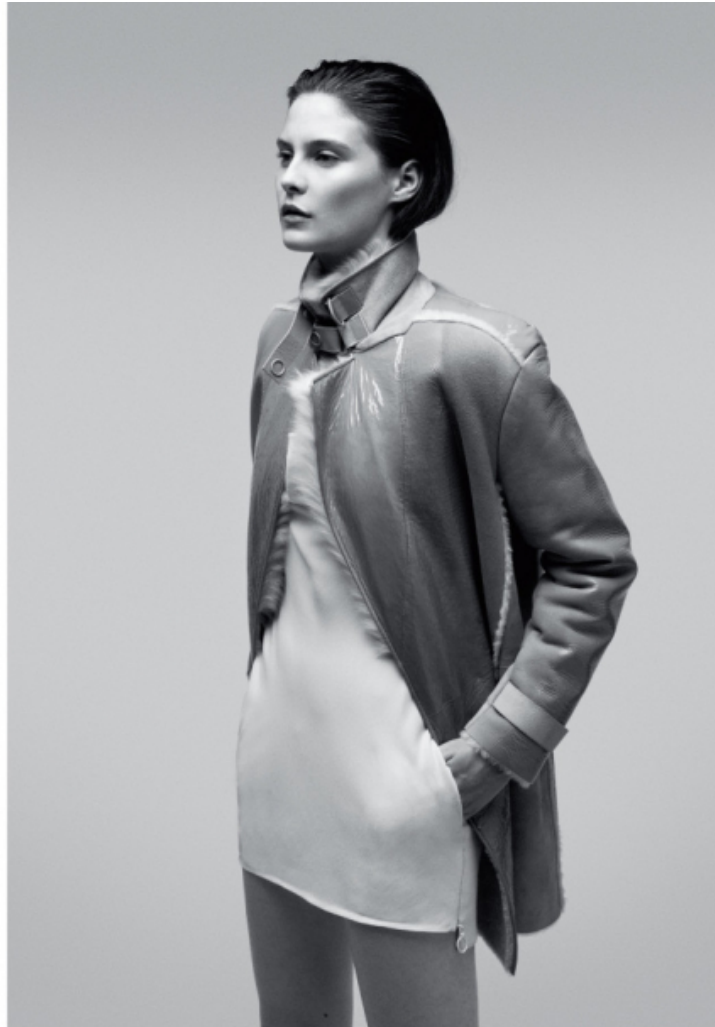
Cappotto in vernice con pelliccia e mini abito drappeggiato Versace.