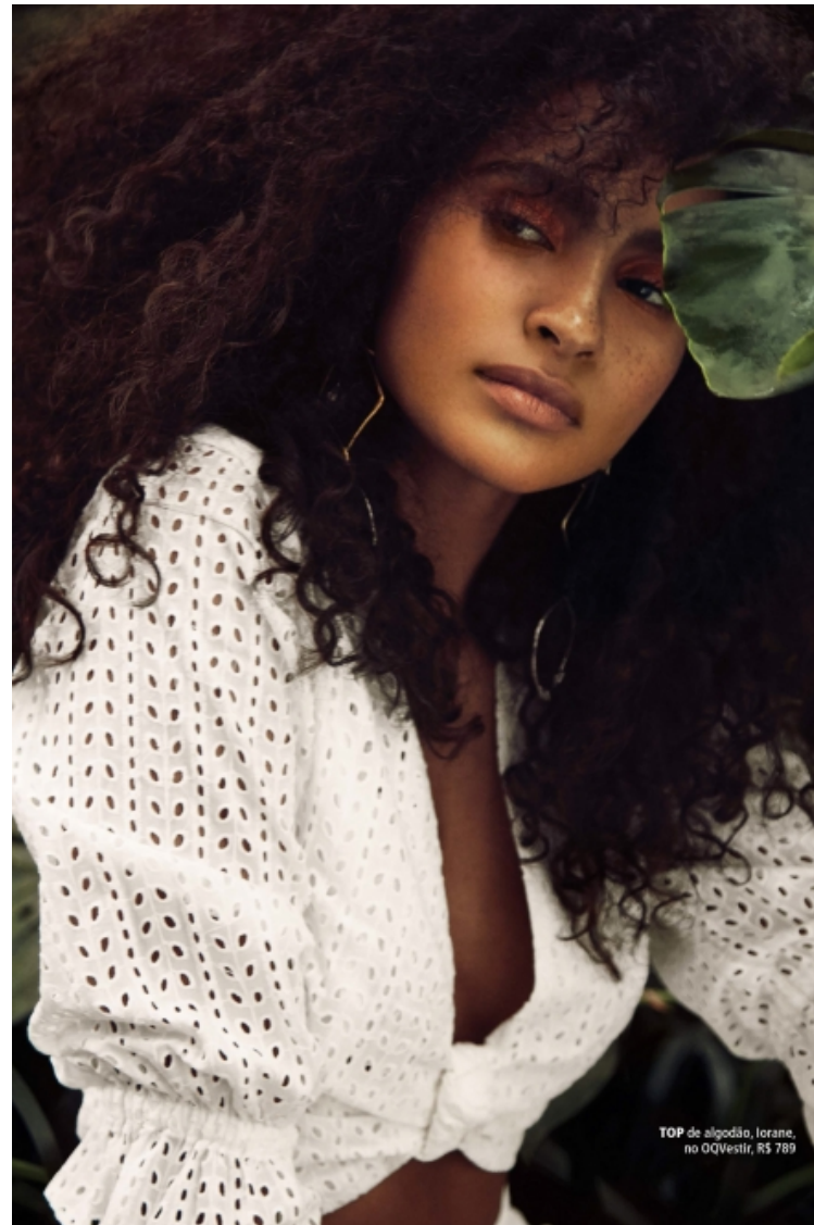
TOP de algodão, lorane, no OQVestir, R$ 789