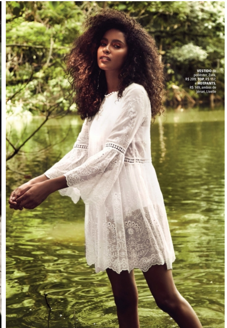
VESTIDO de poliéster, Zara, R$ 209; TOP, R$ 137, e HOTPANTS, R$ 149, ambos de jersey, Livelle