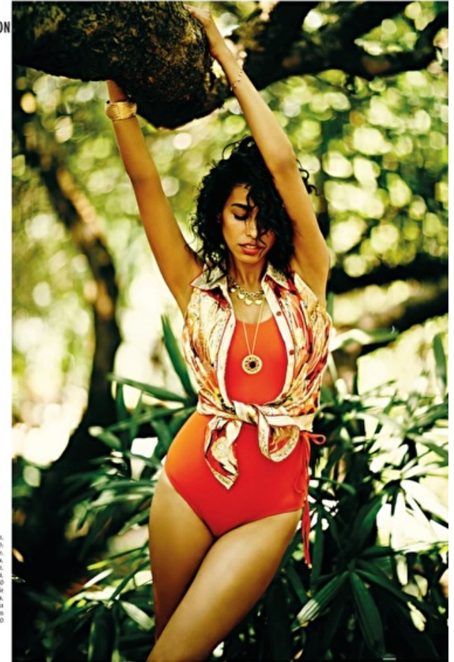
Swimsuit: Tansotte & Gold, ₹ 7,250; printed blouse: Hemanth & Nandini, ₹ 17,000; circular pendant: suseen coll: both Annapadi, ₹ 1,500 and ₹ 4,450 respectively; I&A 'Multiple yr' charm bracelet: Swarya, ₹ 30,000; 'Vintage Sonia Bykari' nautical charm necklace: Vrange, ₹ 15,000