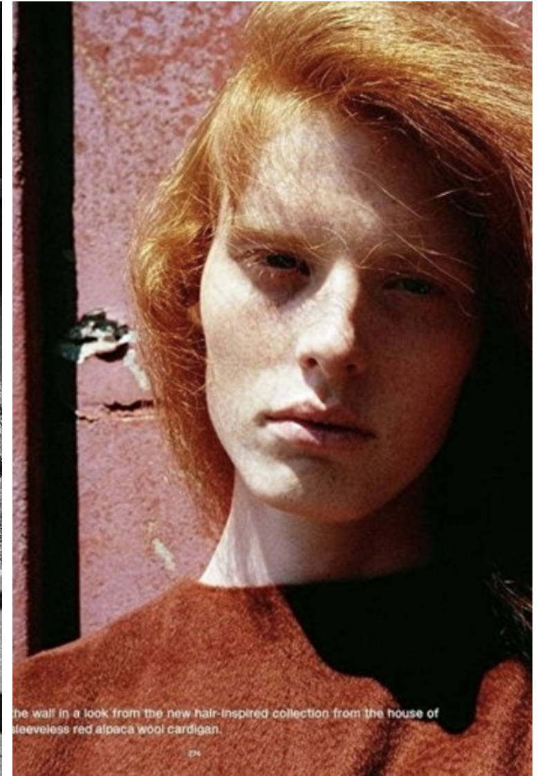
the wall in a look from the new hair-inspired collection from the house of sleeveless red alpaca wool cardigan.