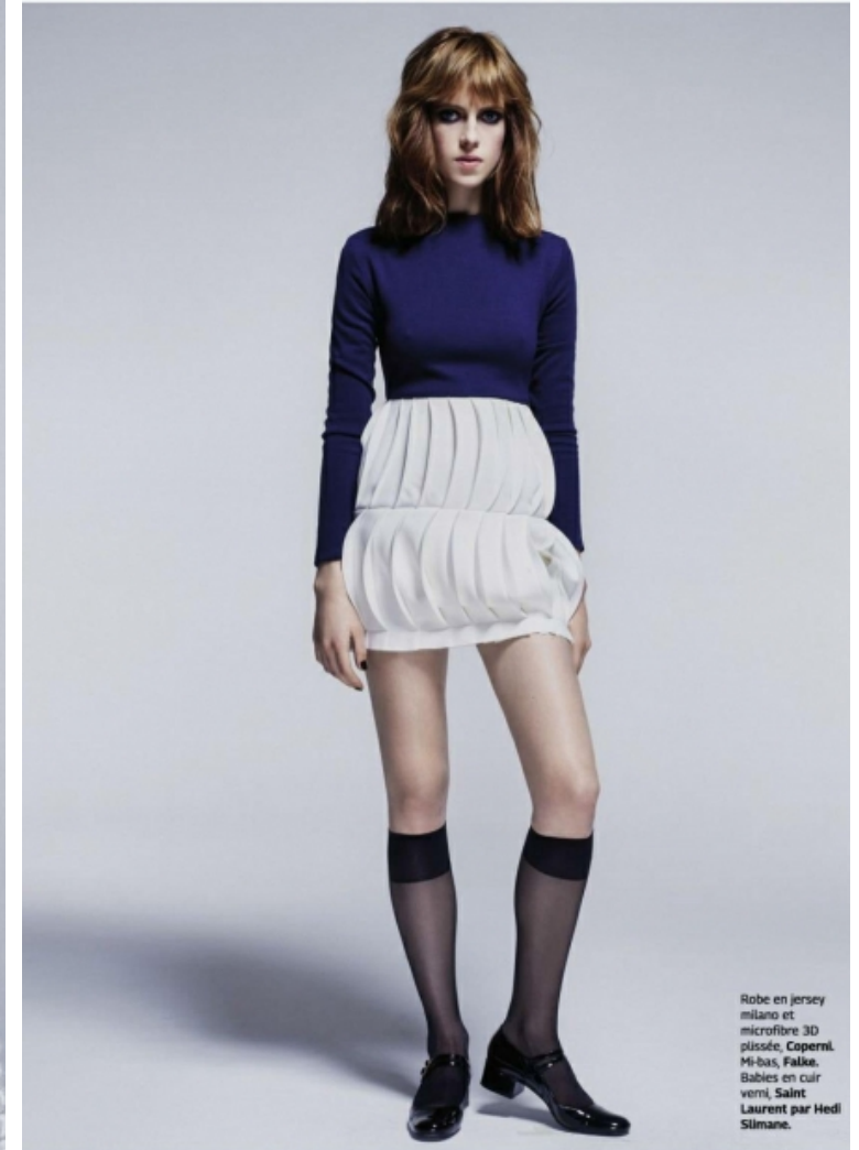
Robe en jersey milano et microfibre 3D plissée, Coperni. Mi-bas, Falke. Babies en cuir verni, Saint Laurent par Hedi Slimane.