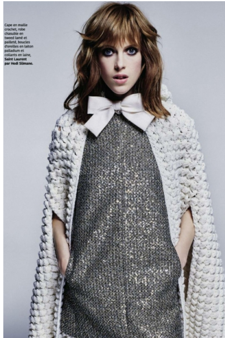
Cape en maille crochet, robe chasuble en tweed lamé et pailleté, boucles d'oreilles en laiton palladium et colliers en laine, Saint Laurent par Hedi Slimane.