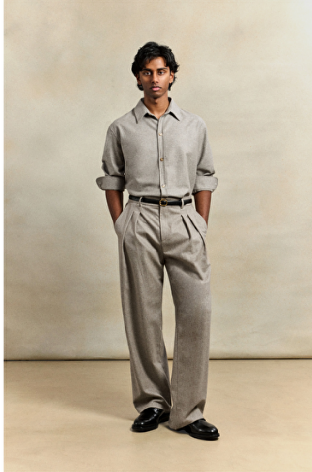
SC10 MINIMAL OVERSHIRT.