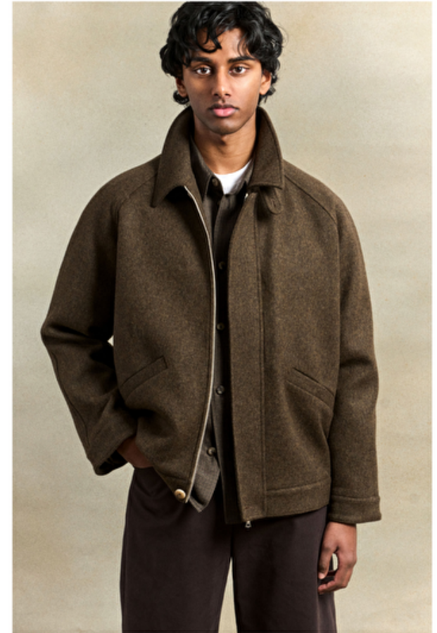
MT65 DRIVER'S JACKET.