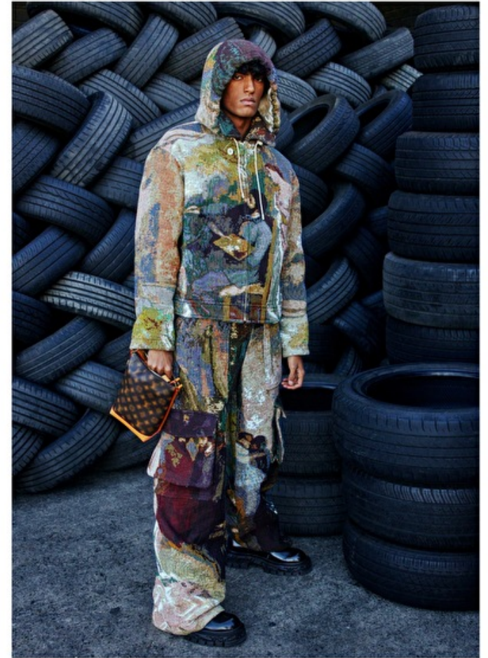
LOUIS VUITTON jacket, pants, shoes and bag. Opposite: LOUIS VUITTON shirt (worn as scarf), model's own earring (worn throughout).