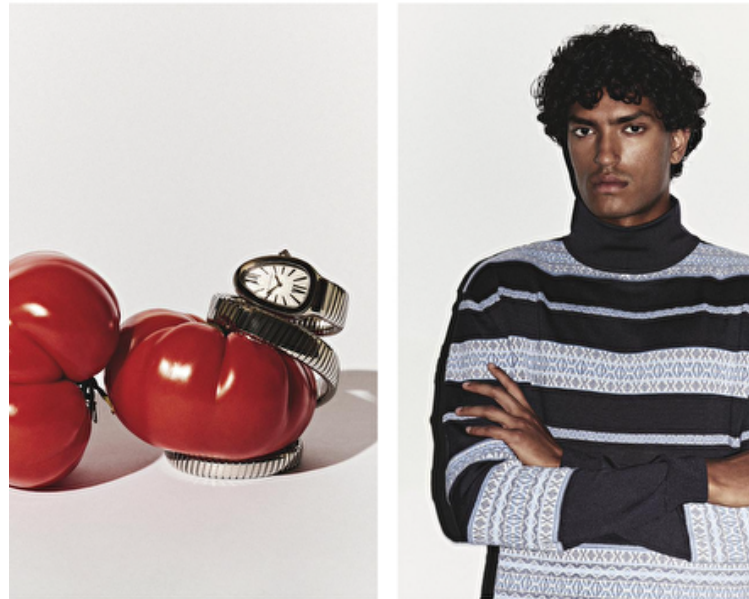
Time is ripe From left: Bulgari's stainless steel Serpenti Tubogas watch, Christian Dior L'Air.