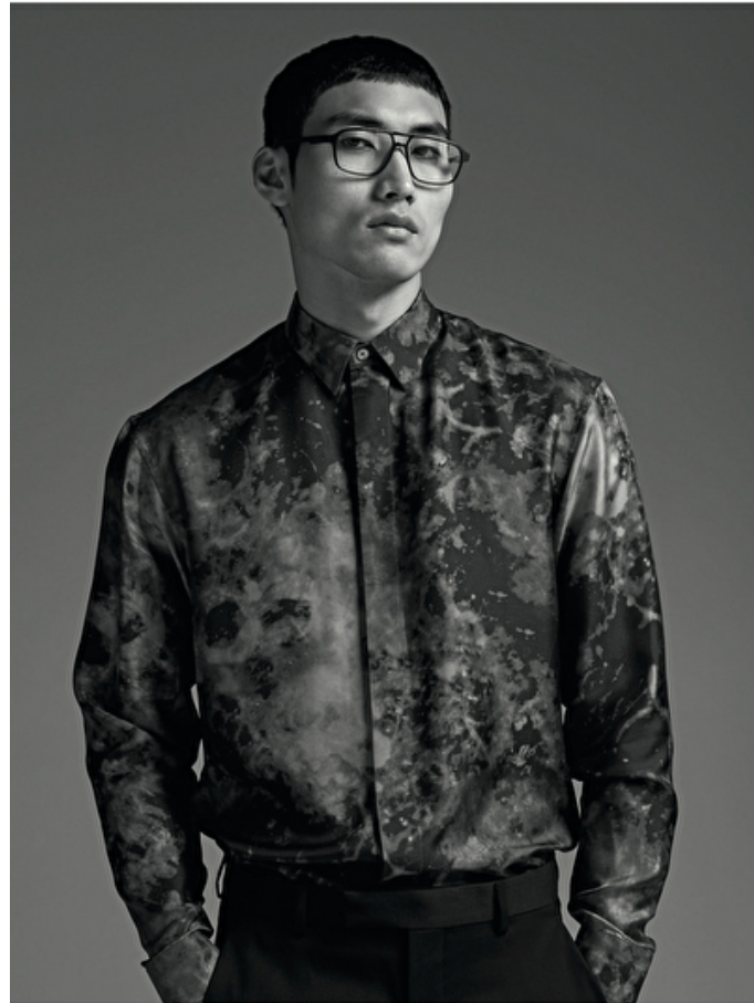
The printed shirt

Camicia e pantalone Bertuti | occhiali Diesel