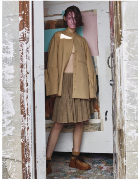
Top, $1,900, and skirt, $2,200, Jil Sander; Bra, $790, Fendi. Shoes, price upon request, Agnona.