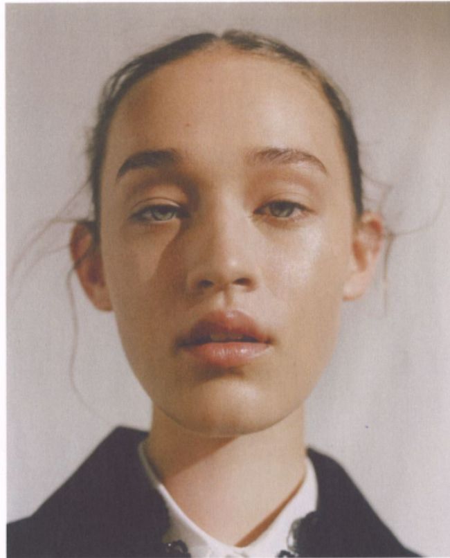
Ci-dessus: Veste en velours et chemise en coton à col en perles, Simone Rocha . Page de droite: Veste en mouton, Roberto Cavalli . Veste en cuir et daim, Coach . Pull col roulé en lerec, Gucci . Cuissardes en cuir, MM6 Maison Margiela .