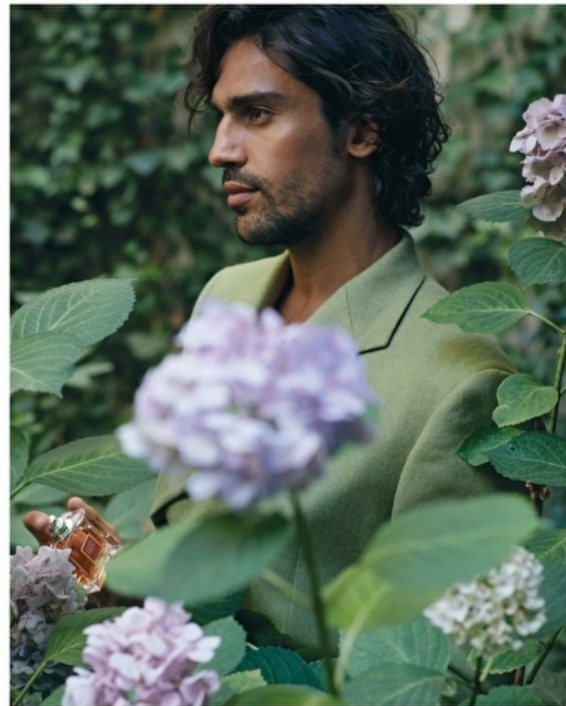
Eau de toilette Intense Habit Rouge L'instinct de Quartier (504 cl) y traje de lana verde de Quartier .