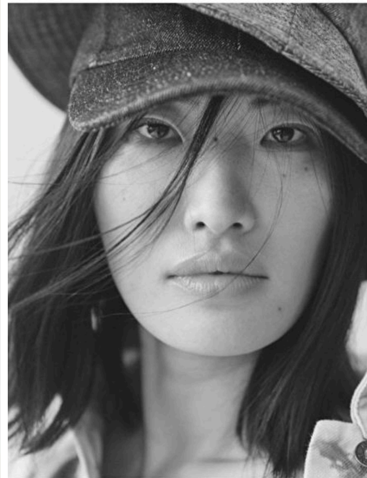
LACK OF COLOR Sombbrero APC Gorra 6387 Chanarra