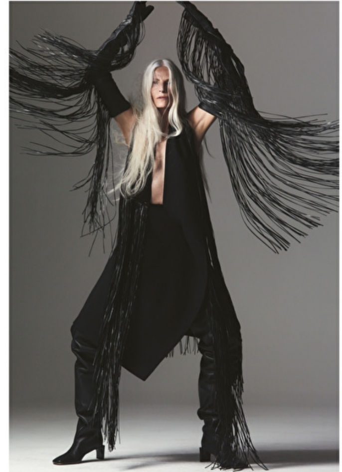
Sportmax skirt, $1850, gloves, PDA, and boots, $1970.