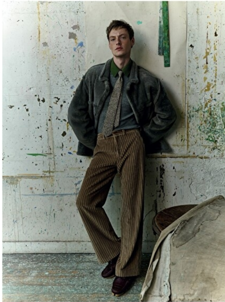
Veste en shearling gris, chemise en trompe-l'œil en coton et soie gris et vert, pantalon en shearling sable, chaussures bateau en cuir bordeaux, Fendi. Cravate en coton, Cinabre.