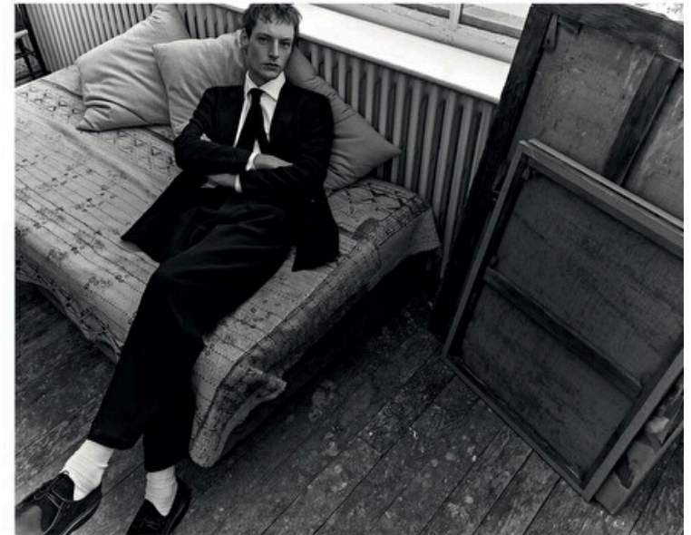
Blazer croisé et pantalon en laine mélangée, chemise en coton, cravate en velours et souliers en cuir, Giorgio Armani.