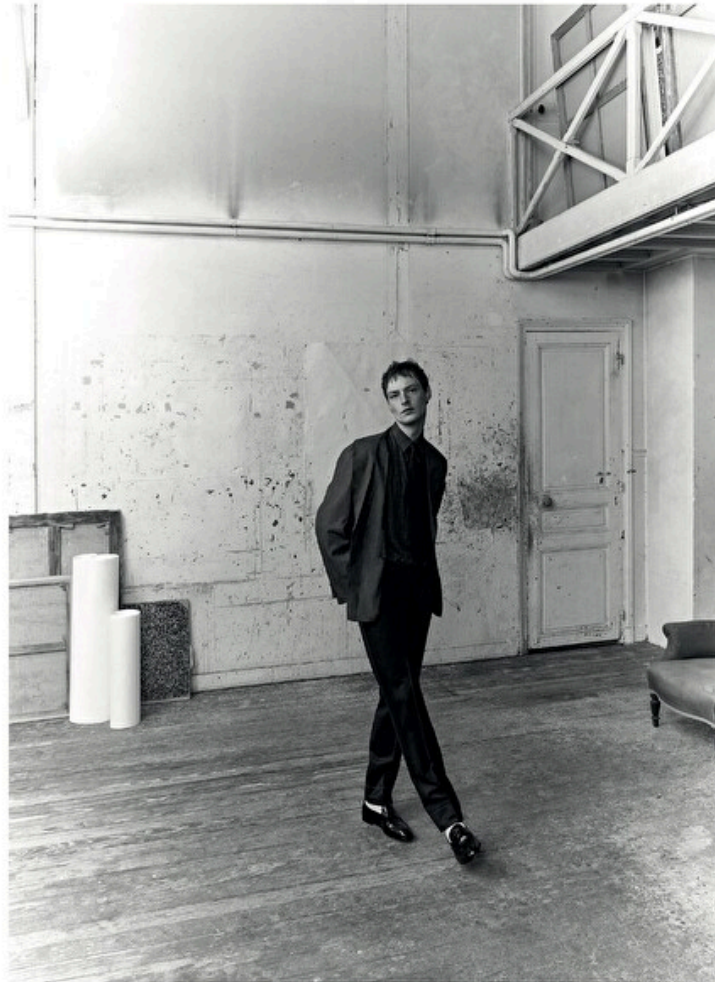
Veste « Leggera » en cachemire et soie, chemise en coton et soie, pantalon en laine, cravate en soie, Brioni, Derbies, Church's.