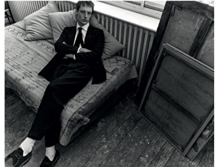
Blazer croisé et pantalon en laine mélangée, chemise en coton, cravate en velours et souliers en cuir, Giorgio Armani.