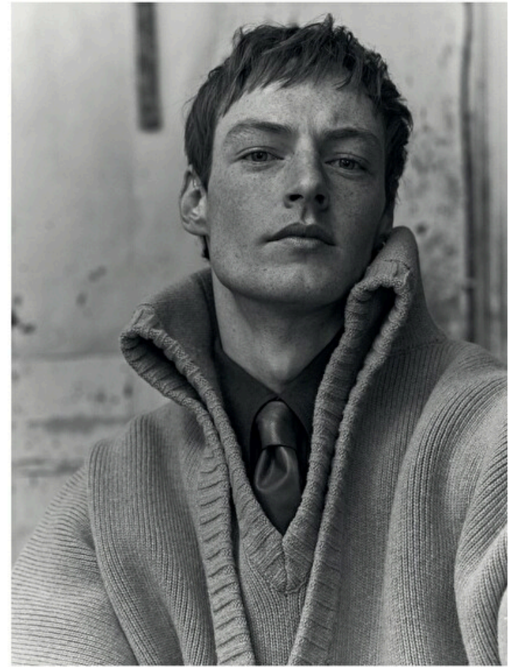
Pull en laine structurée, chemise en laine et cravate en cuir, Bottega Veneta.