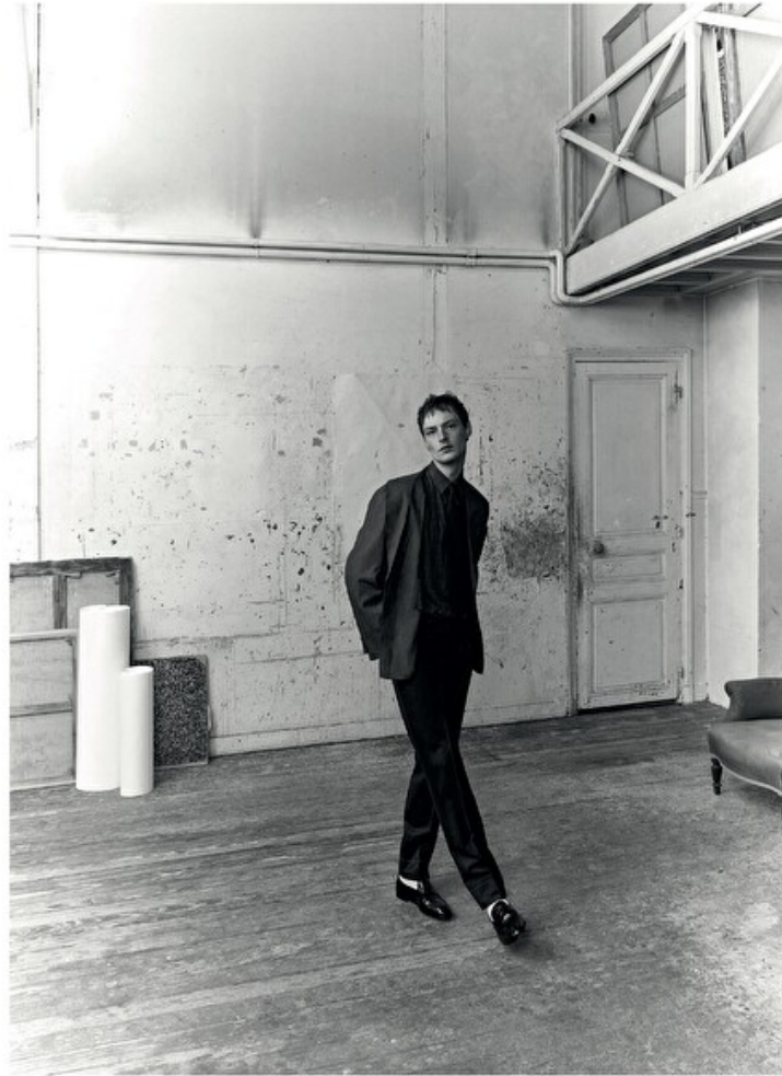
Veste « Leggera » en cachemire et soie, chemise en coton et soie, pantalon en laine, cravate en soie, Brioni, Derbies, Church's.