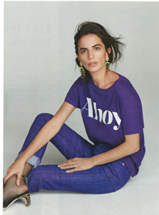
Ahoy there! Set sail into a whole new world of understated cool, in biro-blue denim and oversized tees. Note: this season is awash with '80s accessorising