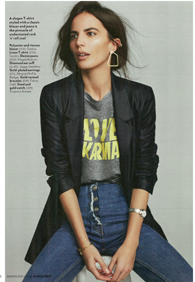
A slogan T-shirt styled with a classic blazer and jeans is the pinnacle of understated rock 'n' roll cool

Polyester and viscose blazer, £150, Gestuz. Linen T-shirt, £100, Sandro. Denim jeans, £300, Magda Butrym. Diamond ear cuff, £2,455, Jaeger Jewellery. Gold-plated earrings, £312, Akria at Wolf & Badger. Gold vermeil bracelet, £595, Felice Dahl. Steel and gold watch, £399, Emporio Armani